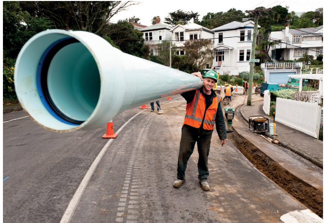
Manual site handling of DN 150 S2 PN 16 Apollo Blue pipe, Wellington City

* Subject to minimum order quantity and availability.